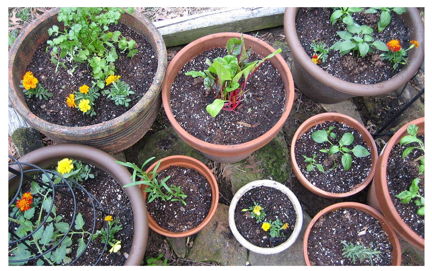
Container gardens are great in small spaces, when you don't have a yard or in areas of poor soil quality.

some don't allow the use of synthetic fertilizers or pesticides –be sure to ask about this before you decide to participate! This is a great option for people who don't have access to a yard, balcony, porch or windows with sufficient sunlight, like city dwellers living in a huge apartment complex. It's also great for people who want to get serious about harvesting their own food and want to produce more than what they are able to in the space they have, or just for people who want the joy of farming with friends.