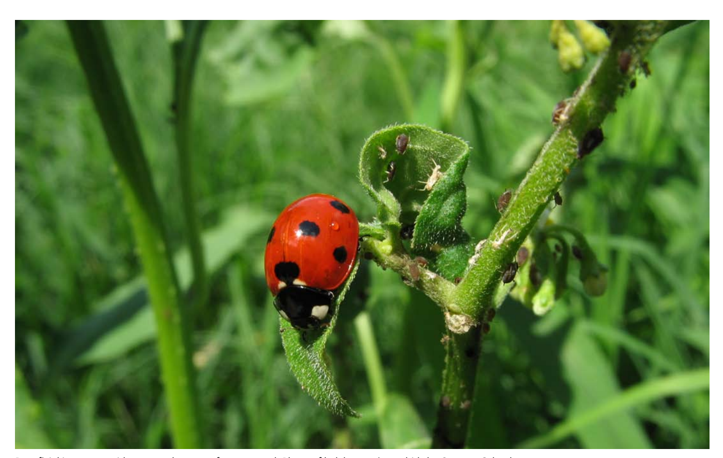
Beneficial insects provide a natural source of pest control. Photo of ladybug eating aphids.