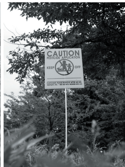
Occupational pesticide exposure, rural living, farming, well water consumption and residential pesticide use have all been linked to elevated rates of Parkinson's disease.