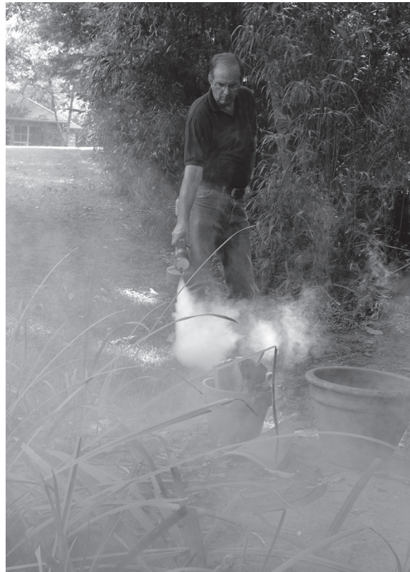
There is some data that shows a significant association between men, exposure to pesticides, and Parkinson’s disease.

However, there are epidemiologic and toxicologic studies that have identified specific pesticides linked to PD. (See page 18.) Studies that identify the mechanisms by which pesticides lead to PD, such as protein aggregation (a-synuclein), effects on the striatal dopaminergic