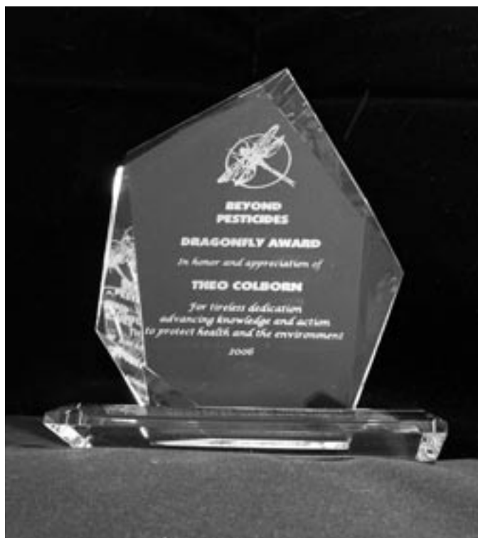
The Dragonfly Award: Beyond Pesticides is using the dragonfly as its logo to symbolize the important role it plays in maintaining ecological balance as part of the delicate ecosystem. The Dragonfly Award symbolizes the importance that the honorees play in protecting the environment and all that depend on it for life.