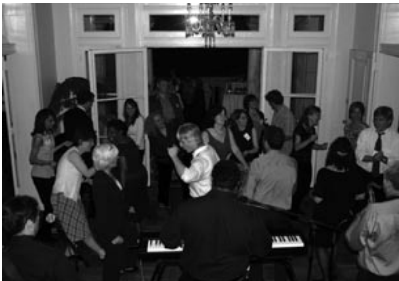
Beyond Pesticides supporters know how to party

ally, as I've worked to protect children. I had never been to a Beyond Pesticides dinner before. I know the science, I know the activism of the organization, but I'm learning that it really is something of a family. And I guess I shouldn't really be surprised because it is about protecting families and I've worked to protect children from the health effects of toxic exposures and educate my col-