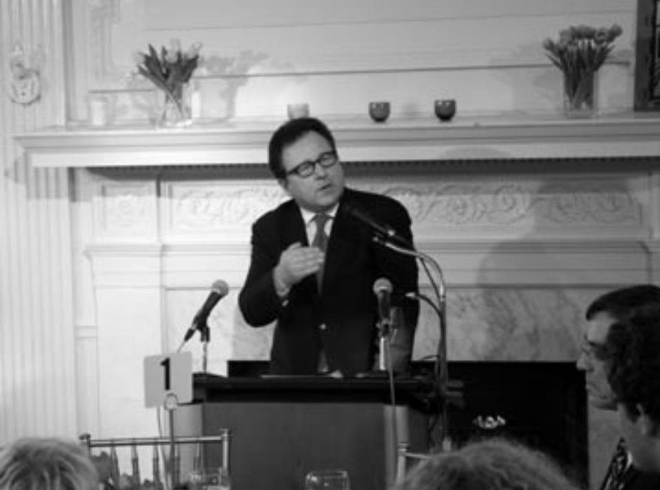
Gala Host, actor Bruno Kirby

should show up and we'll all talk and you'll get to know what Beyond Pesticides is all about." So I said OK.