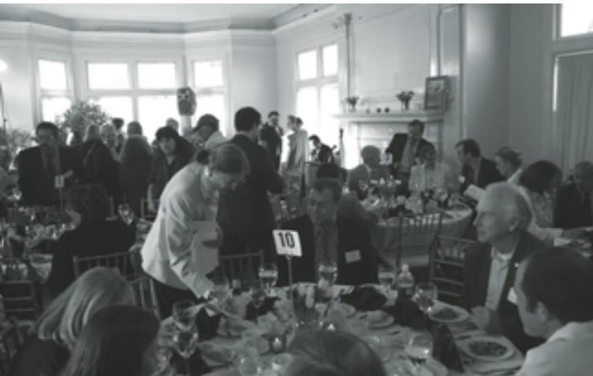
Guests enjoy organic food at Beyond Pesticides' 25 th Anniversary Gala

All of this happens in Eugene, Oregon, and when we're here in Washington or New York or San Francisco, Eugene, Oregon, seems really grassroots. But they make enormous changes for the rest of us all over the country. Every time I do a performance of A Sense of Wonder I mention NCAP's name because they are the strongest and the best grassroots organization I have encountered in now 14 years of traveling back and forth across this country with this play – the very best, bar none.