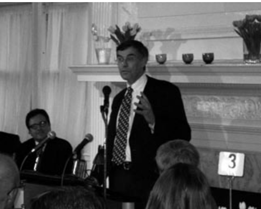
Rush Holt addresses the Gala crowd

Environment Protection Act. He also focuses his energy on sustainable development, medical research, farmland protection, human rights and more. Prior to serving as a Member of Congress, he was assistant director of the Princeton University's Plasma Physics Laboratory.)