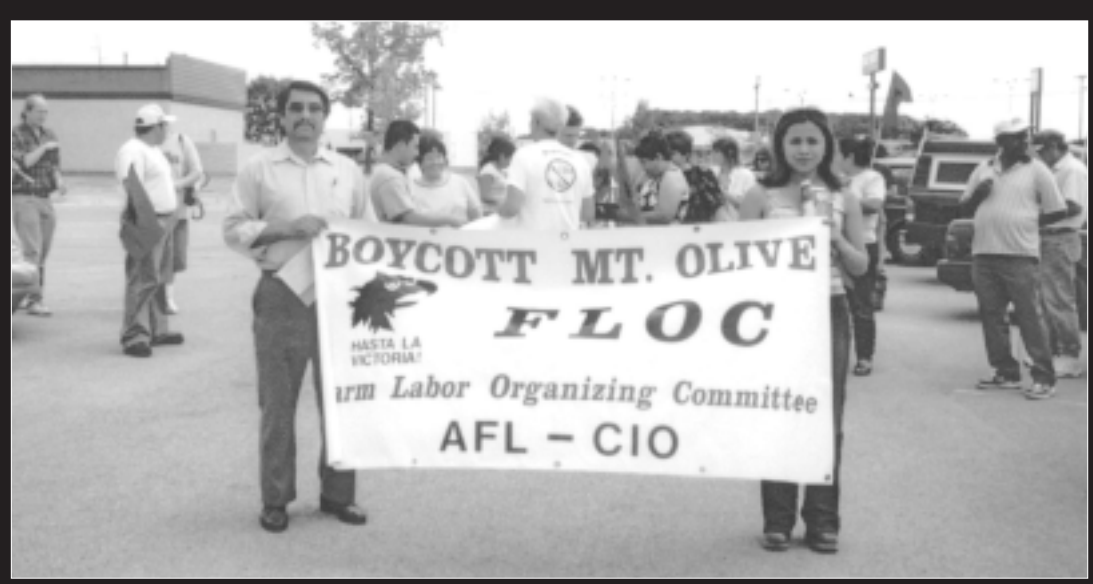
FLOC demonstration urges consumers to boycott Mt. Olive Pickle Company outside of a North Carolina grocery store.

The Mt.Olive Pickle Company Boycott is being organized by FLOC, 1221 Broadway, Toledo, OH 43609, 419-243-3456. For more information on the boycott, see www.floc.com.