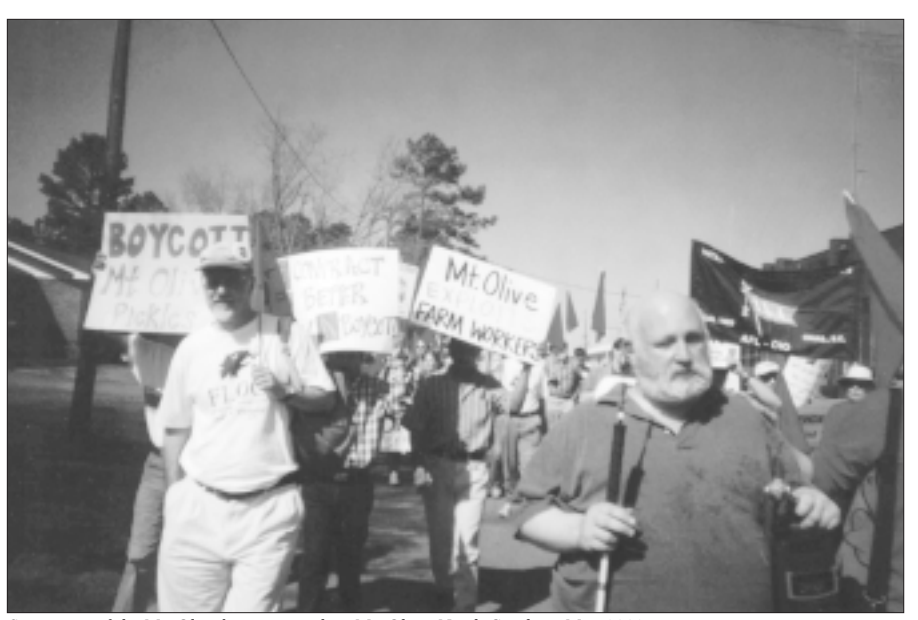
Supporters of the Mt. Olive boycott march in Mt. Olive, North Carolina, May 2003.

These are the guys whose farms I came to work on as a little kid. They would steal from us, and they would rob us. They were diversified, not only tomatoes and cucumbers, but also sugar beets, corn, wheat and soybeans. I would help many of them bail hay and feed their cows, pigs and horses. These are the small family farmers. But the small family farmer in our