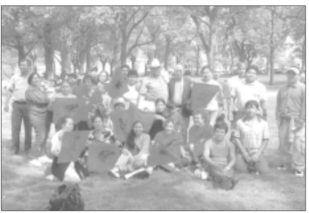
FLOC staff and members pose for a photo after a day of advocacy work in Washington, DC.

Aguila Negra Band, send $12 to Beyond Pesticides.