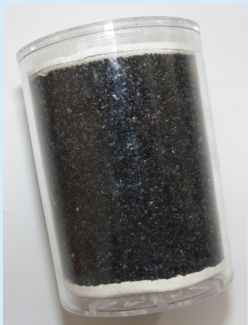
Carbon water cartridge. Photo Courtesy Emilian Robert Vicol, July 31, 2010.

Reverse osmosis filters (also called ultrafiltration). Reverse osmosis filters are said to remove 99 percent of the toxic chemicals in water, including some pesticides. Reverse osmosis utilizes normal household water pressure to force water through a selective semi-permeable membrane that separates contaminants from the water. Treated water emerges from the other side of the membrane, and the accumulated impurities left behind are washed away. However, the downside of reverse osmosis filters is that they use a great deal of energy and water. Reverse osmosis filters generally can be purchased for $300 to $600.