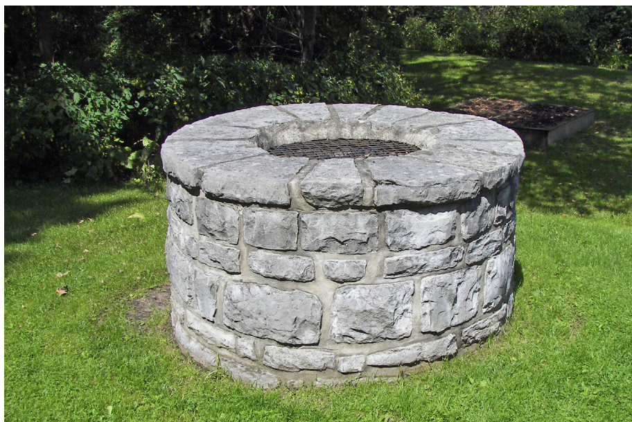
Water well for the Herkimer House in Danube, Herkimer County, New York. September 2009 Author: Wknight94.

Although the “screening” method is less expensive and can identify select hazardous chemicals, a comprehensive pesticide test is more accurate and better able to determine if other pesticides are present. If you do decide to “screen”