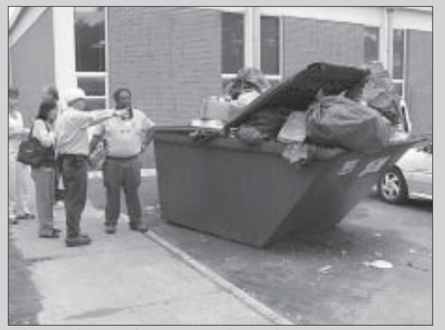
A dumpster that is overflowing attracts all types of pest problems. Dumpsters' lids should fit tightly.