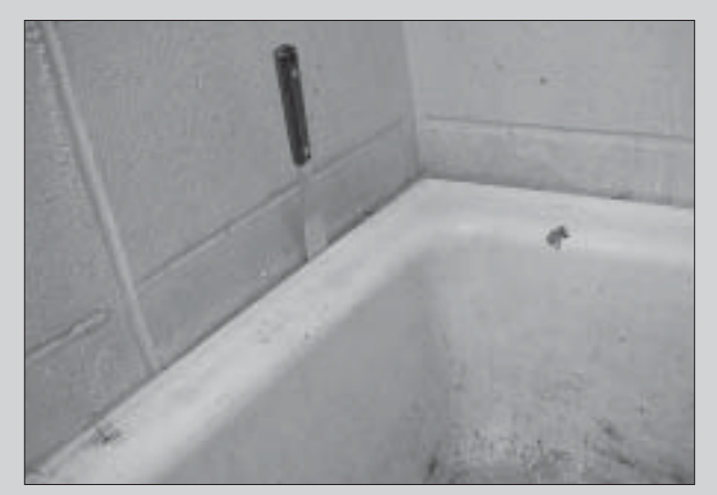
An icing spatula shows that the seal around a sink is missing, identifying the space that pests use to move around.

Before we started IPM, the cost was $34,000 annually. After I was hired we cut that to about half.