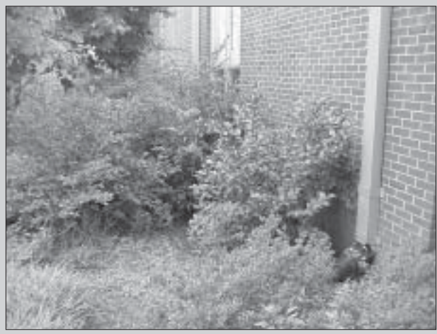
Harborage like this can lead to building invasion