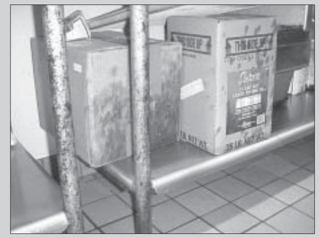
The grease and starch from these boxes provide plenty of food for pests.