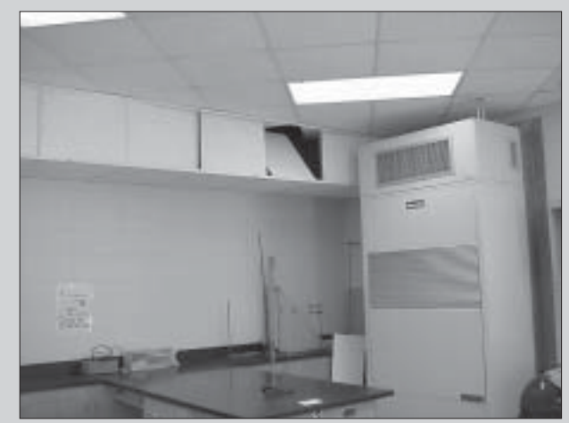
Replace missing or damaged ceiling tiles.