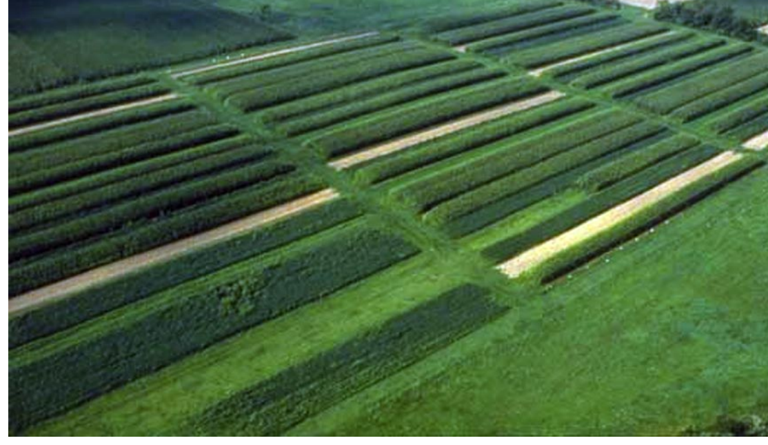
Now in its 27th season, The Rodale Institute Farming Systems Trial® is the longest running comparison of conventional corn and soybean row crop farming to organic production systems of corn and soybean.

In 2003, The Rodale Institute's findings show that organic grain production systems increase soil carbon 15% to 28%. Moreover, soil nitrogen in the organic systems increases 8% to 15%. Our 2006 deep profile carbon readings on soils receiv-