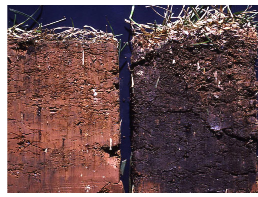
Notice the difference in the richness of the soil at 1% (left) and 5% (right) carbon.

In addition to capturing more carbon as soil organic matter, organic agricultural production methods also emit less greenhouse gases through more efficient use of fuels. Energy analysis of the FST by Dr. Pimentel show that organic systems use only 63% of the energy input used by the conventional corn