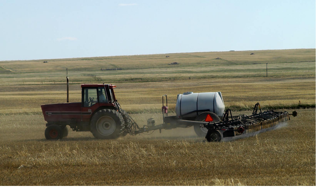
In addition to capturing less carbon in soil, conventional agricultural production methods also emit greater greenhouse gases and require the hazardous use of chemical fertilizers and pesticides.

erlands and Germany have reviewed our findings and use them to incorporate organic farming targets as a part of their greenhouse gas targets for their roadmap and strategies.