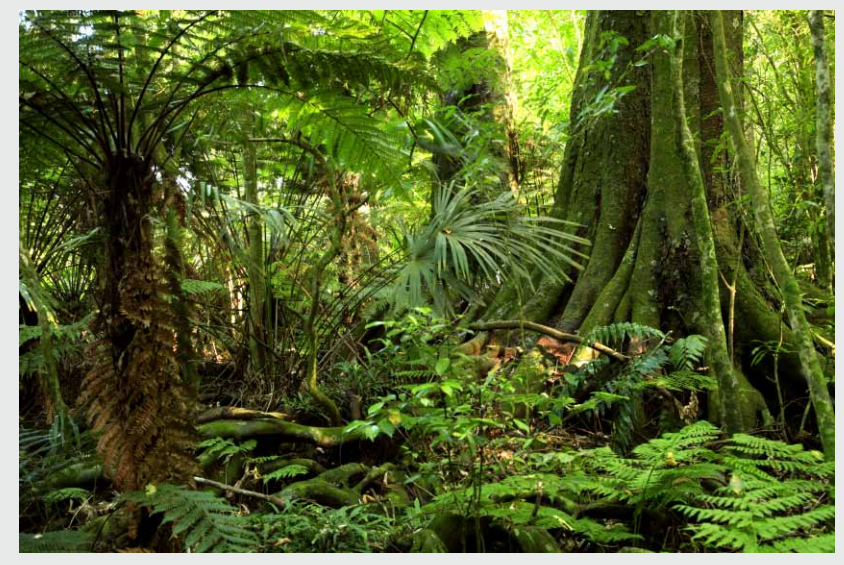
When many people hear the word "biodiversity," they think of the tropical rainforest. While rainforests are one of the most biodiverse ecosystems on the planet, biodiversity is important to many types of ecosystems, from rainforests and reefs, to the soil of a farm or backyard turf.

Biodiversity operates at three distinct levels in natural systems. First, genetic biodiversity exists within every species. Species must maintain sufficient diversity within their collective gene pool for future generations to adapt. Secondly, species biodiversity represents the collection of different species that co-exist as a community within an ecosystem. An ecosystem is a distinct environmental habitat combining interdependent organisms and non-living elements, such as a coral reef or tall grass prairie. In general, ecosystems with greater biodiversity are better suited to withstand disturbance and to recuperate from adverse impacts. Finally, ecosystem biodiversity measures the abundance or variety of adjoining yet subtly self-contained ecosystems within a larger geographic area.