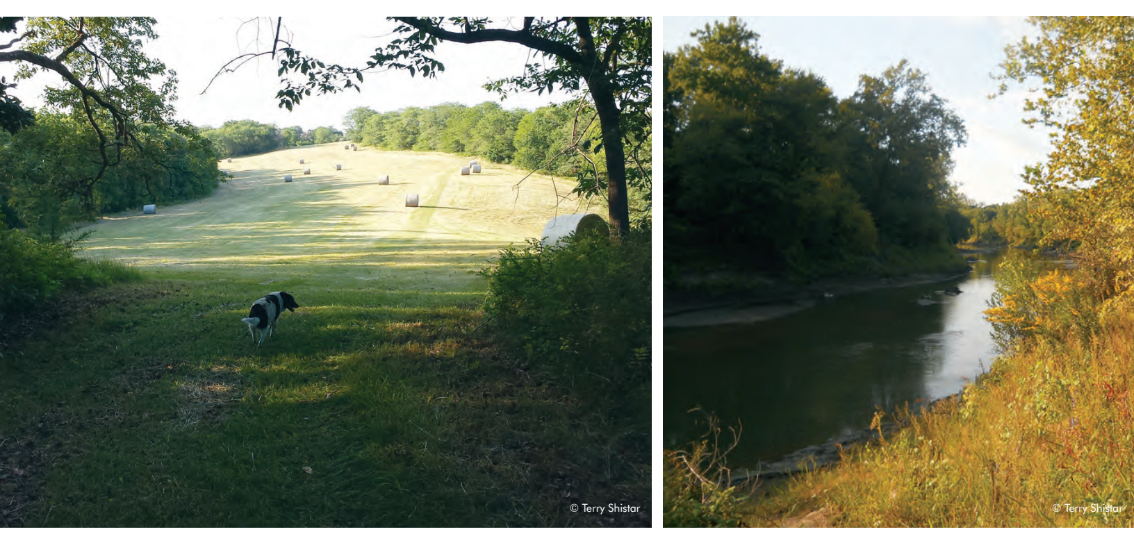
Hedgerows along hayfield.