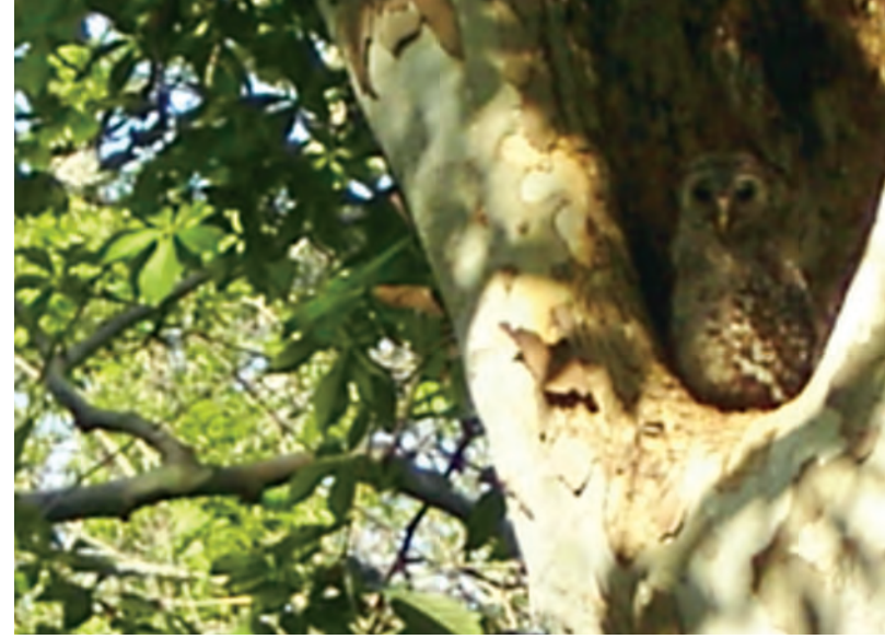
Conserving nesting sites.