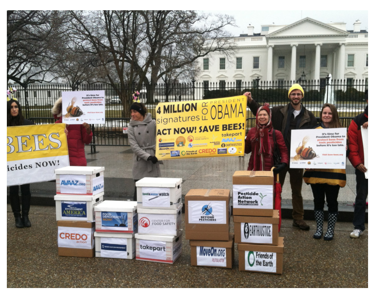
Beyond Pesticides Staff joins other environmental groups to rally at the White House to demand that the federal government ban neonicotinoid pesticides.

International efforts to protect pollinators from highly toxic systemics pesticides have had more success restricting neonicotinoids. In 2013, the European Union (EU) took critical steps to protect pollinators from the hazards associated with their use. Despite attempts by agrichemical corporations to delay or reverse the decision, the two-year (still continuing), continent-wide ban on bee-harming pesticides (clothianidin, thiameth-oxam, and imidacloprid) went into effect. The ban came several months after the European Food Safety Authority (EFSA) released a report identifying "high acute risk" to honey bees from uses of certain neonicotinoid chemicals.<sup>206</sup> EFSA is continuing to update its assessment of the risks to bees posed by the three neonicotinoid chemicals, which will take a look into their use as seed treatments and granules. The assessment is slated for completion by January 2017.<sup>207</sup>