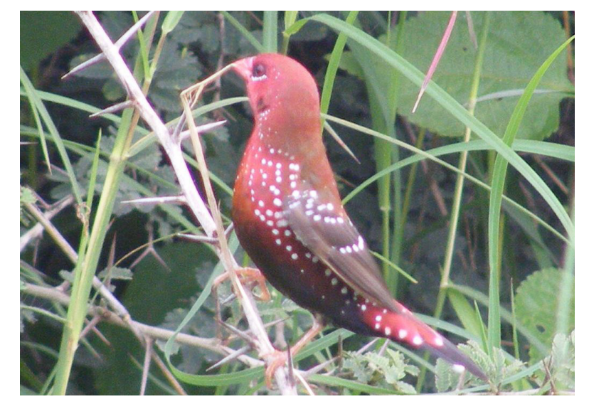
Red Munia Amandava amandava. Photo by Dr. Raju Kasambe, 2011.

el.175 Amphibians, which have been facing an existential threat with staggering declines in populations across species over the past few decades,<sup>176,177</sup> have also been shown to be sensitive to systemic insecticide exposure. Researchers in Argentina found that imidacloprid exposure to the Montevideo tree frog tadpoles resulted in acute effects, such as increased genetic damage (Pérez-Iglesias et al., 2014).<sup>178</sup> Sub-lethal exposure to