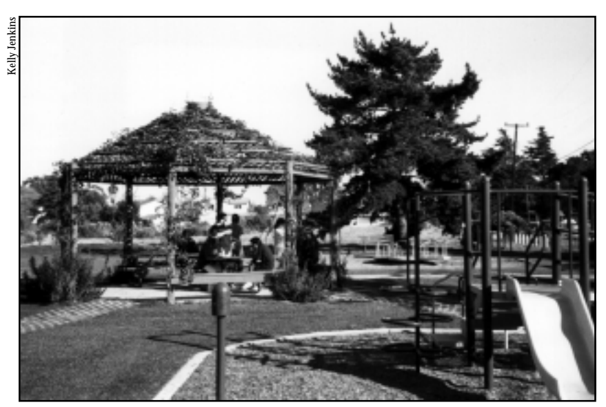
An Isla Vista playground beautifully maintained with no pesticides.

Staff also replace exotic plant species with native plants to manage plant pests. Park personnel have eliminated exotic trees such as Curly dock and Eucalyptus. This removes a food source for exotic and hard-to-manage pests that may not have natural predators in the area. Replacement tree species include willows, oaks, sycamores, alders and cottonwoods.