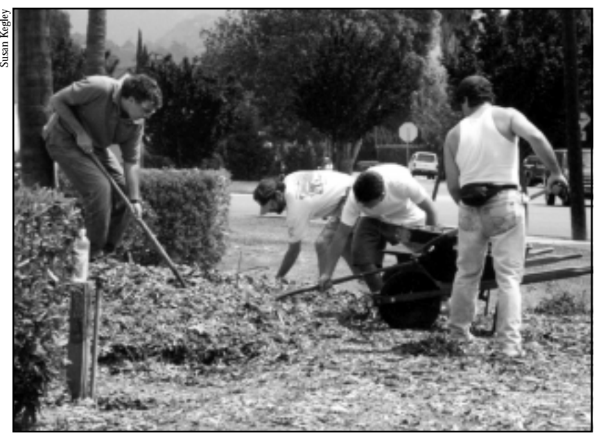
Staff at Vista de las Cruces school spread mulch to keep weeds down.

(Roundup ^{\text{TM}} ) were applied to the school grounds. Poison baits were used for mice and gophers, with only limited success.