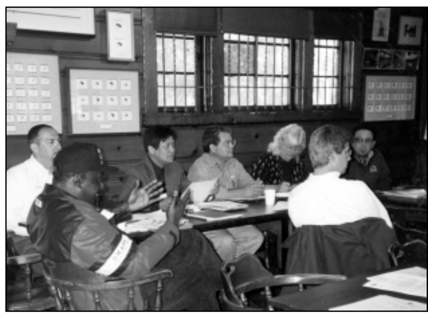
Members of the Technical Advisory Committee discussing pest management strategies.

The success of the TAC and department IPM coordinators requires the dedication of all