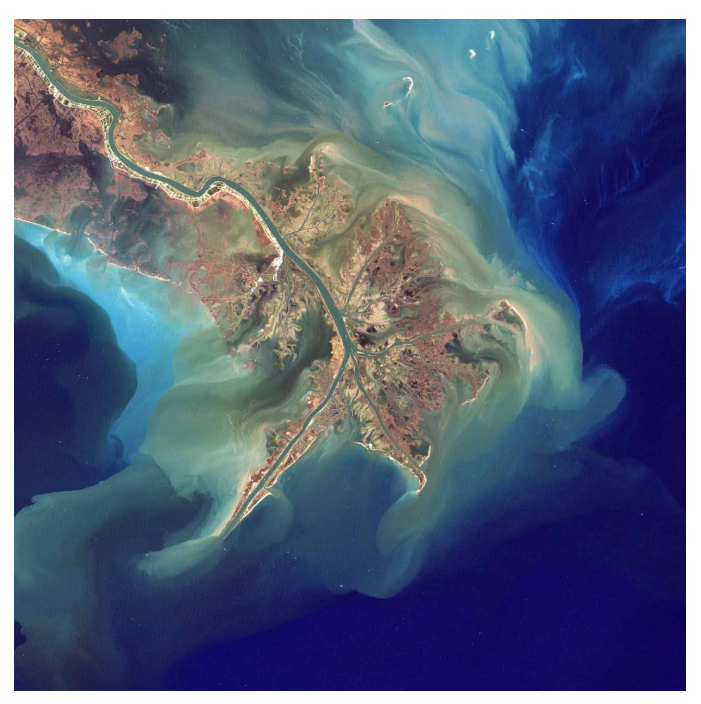
An 8,500 square mile dead zone has formed in the Gulf of Mexico, not far from the mouth of the nutrient-laden Mississippi River.

From its inception, the organic paradigm has placed the establishment and nurturance of a rich and diverse biological community within the soil as its paramount objective. "Feed the soil, not the plant" sums up the principle of building biodiversity at the microbiological level that originated with organic visionary Sir Albert Howard at the turn of the 20th century. The bacteria, fungi, and