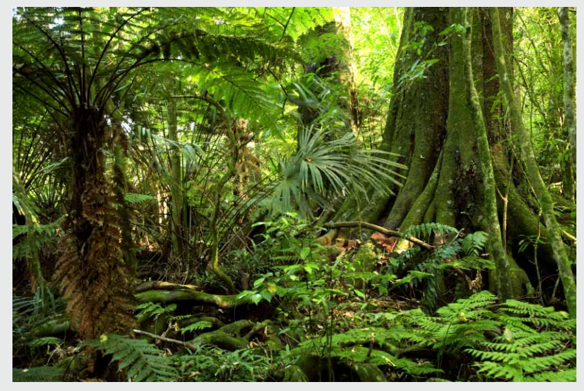
When many people hear the word "biodiversity," they think of the tropical rainforest. While rainforests are one of the most biodiverse ecosystems on the planet, biodiversity is important to many types of ecosystems, from rainforests and reefs, to the soil of a farm or backyard turf.

Biodiversity operates at three distinct levels in natural systems. First, genetic biodiversity exists within every species. Species must maintain sufficient diversity within their collective gene pool for future generations to adapt. Secondly, species biodiversity represents the collection of different species that co-exist as a community within an ecosystem. An ecosystem is a distinct environmental habitat combining interdependent organisms and non-living elements, such as a coral reef or tall grass prairie. In general, ecosystems with greater biodiversity are better suited to withstand disturbance and to recuperate from adverse impacts. Finally, ecosystem biodiversity measures the abundance or variety of adjoining yet subtly self-contained ecosystems within a larger geographic area.