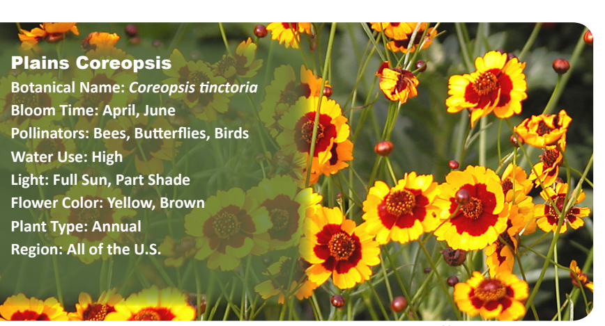
Lewis, C. [Photographer] 2007. plains Coreopsis. Available at: https://commons.wikimedia.org

Percy, I. [Photographer] 2010. Lemon beebalm. Available at: http://floreznursery.blogspot.com/2010/12/