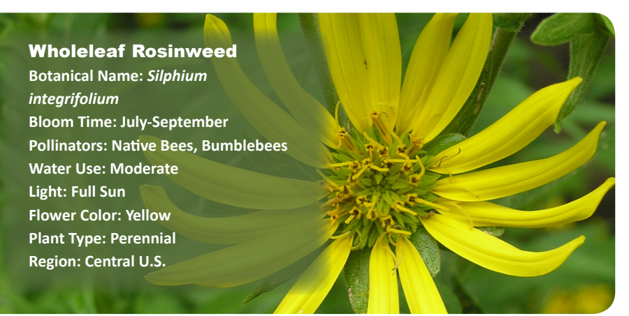
IPFW. 2008. Rosinweed. Available at: http://www.ipfw.edu

The late summer and fall season seems to indicate a slow-down for bees. In fact though, autumn flower gardens can continue to provide food and shelter for bees, pollinators, and wildlife at a time when it may be otherwise scarce. Several flowers, like asters, echinacea, goldenrod, and even sunflower, continue to bloom right up through the end of October, giving bees a good supply of pollen and nectar during the cold winter weather.