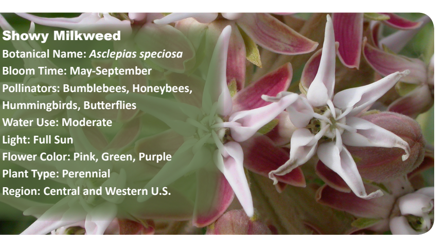
Lavin, M. [Photographer] 2007. Asclepias speciosa. Available at: https://commons.wikimedia.org