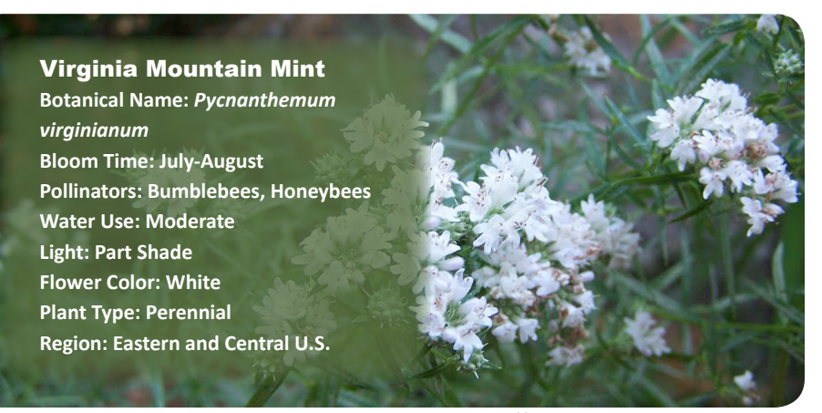
Shiela [Photographer].2011. Virginia Mountain Mint. Available at: http://greenplace-chapelhill.blogspot.com

Crazytwoknobs [Photographer] 2008. Partridge Pea, Schaumburg IL. Available at http://en.wikipedia.org