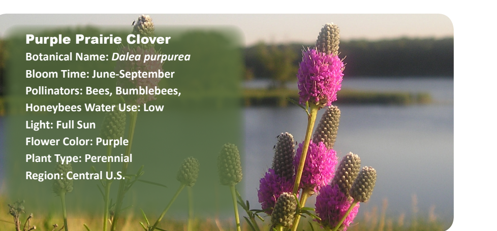
Hansel, B. [Photographer]. 2005. Prairie Clover. Available at:http://en.wikipedia.org