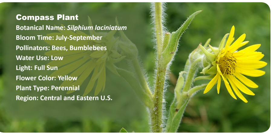
Cressmoor Prairie Nature Preserve. 2011. Compass Plant. Available at: http://www.heinzetrust.org