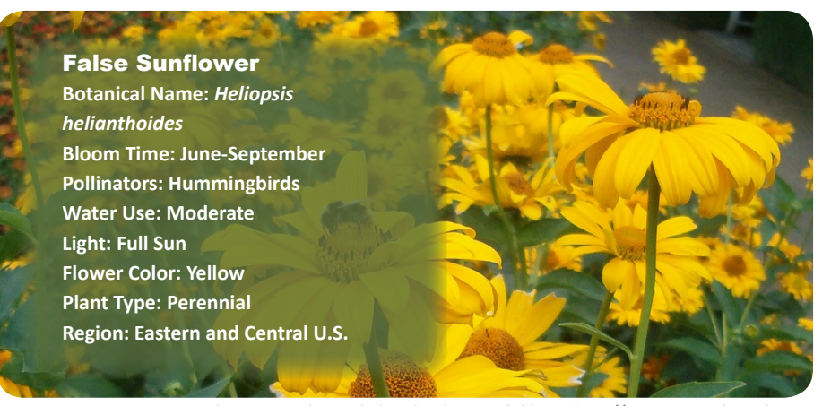
Jeannelle [Photographer]. 2010. Grayhead Coneflower. Available at: http://midlifebyfarmlight.blogspot.com

BotBln. 2011. Heliopsis helianthoides. Available at: http://commons.wikimedia.org