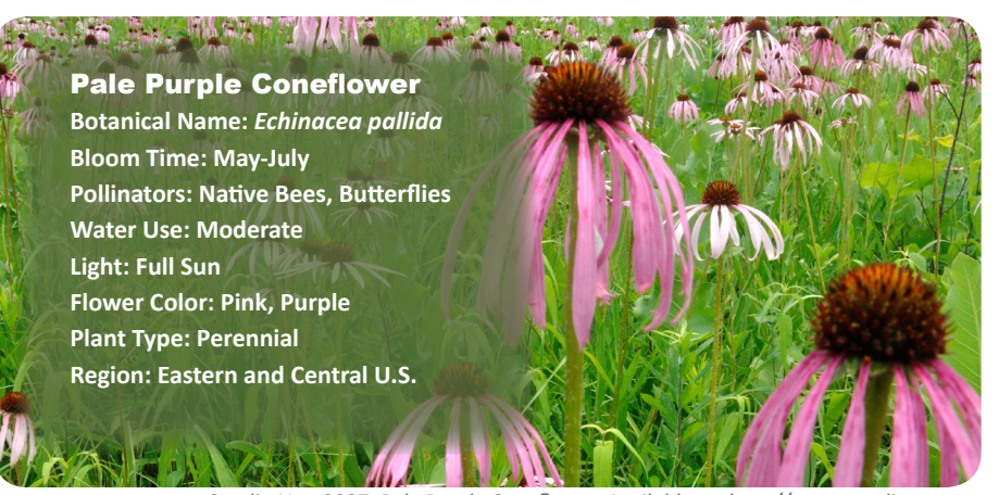
Sandia Net. 2007. Pale Purple Coneflower. Available at: http://www.sandianet.com