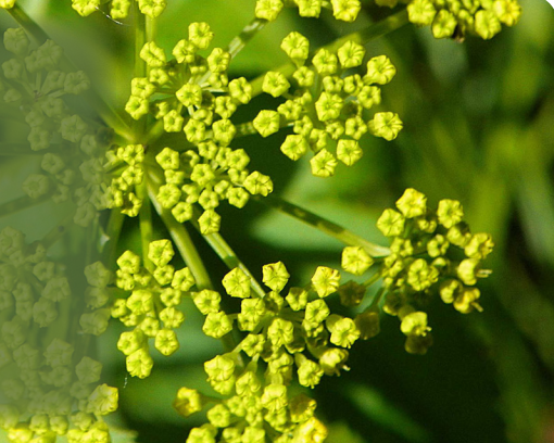
North Dakota Parks. 2011. Golden Alexander. Available at: http://www.parkrec.nd.gov

Golden Alexander Botanical Name: Zizia aurea Bloom Time: May-September Pollinators: Butterflies, Bees Water Use: Moderate Light: Full Sun, Part Shade Flower Color: Yellow Plant Type: Perennial Region: Central and Eastern U.S.