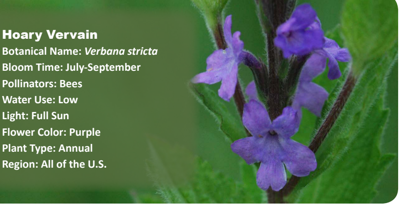
Hoary Vervain aka Verbena stricta