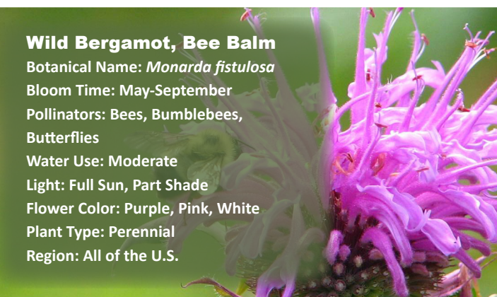
Otsego Conservation. 2008. Wild Bergamot. Available at: http://www.otsego.org