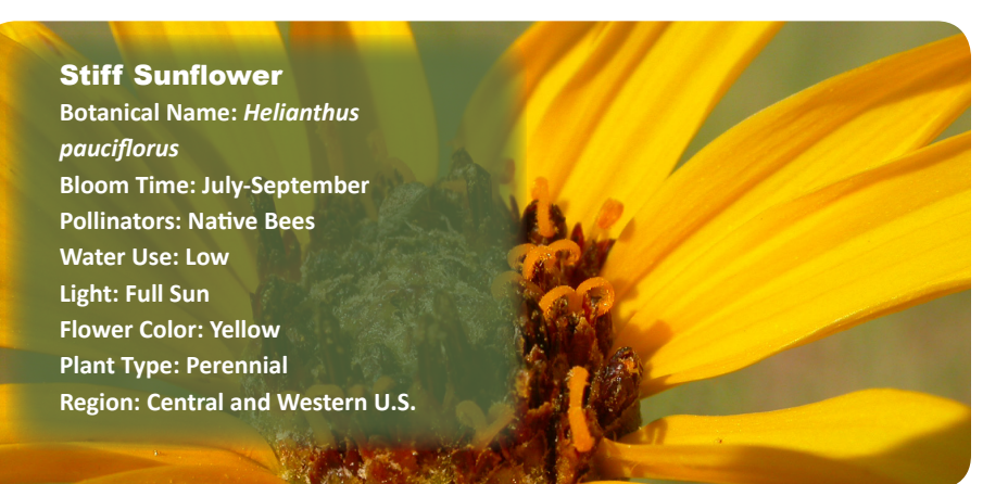
Helianthus pauciflorus.