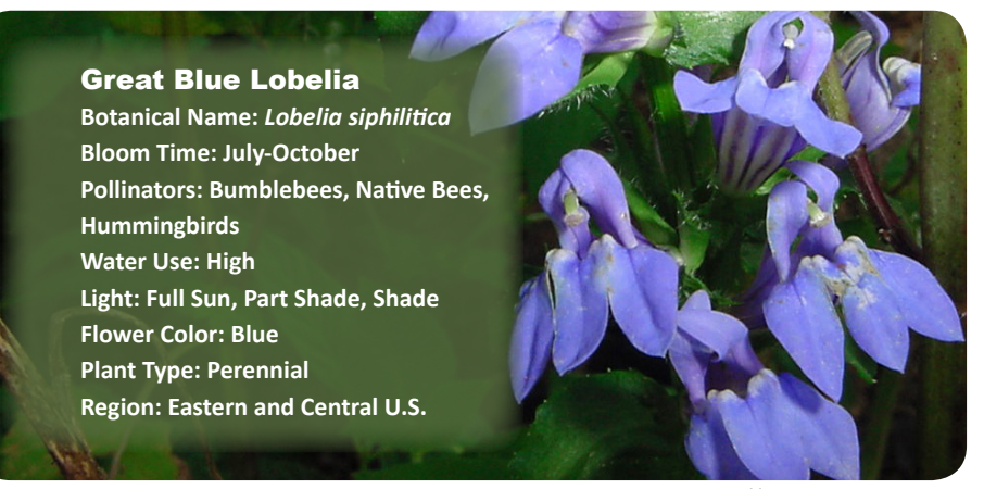
Quick Growing Trees. 2012. Great Blue Lobelia. Available at: http://www.gonative.4t.com

BotBln. 2011. Heliopsis helianthoides. Available at: http://commons.wikimedia.org