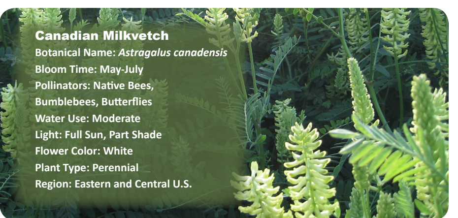
MillbornSeeds. 2012. Canada Milkvetch. http://blog.millbornseeds.com/

IPFW. 2010. Blue Vervain. http://www.ipfw.edu/native-trees/images/Verbena,%20Blue,%20Flower78.JPG/