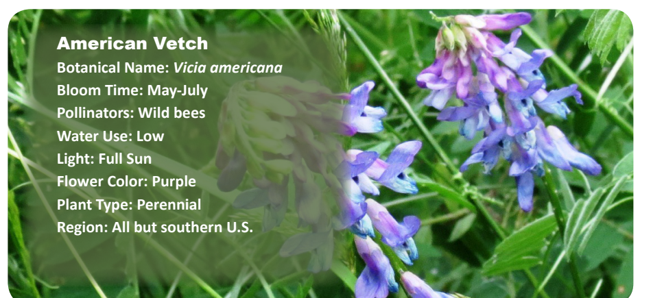
American Vetch.