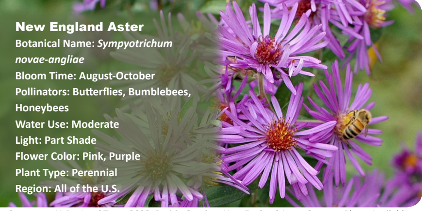
Cresmoore Heinz Land Trust. 2009. Prairie Gentian, New England Aster, CompassPlant. Available at: http://www.heinzetrust.org

Hough, C. [Photographer]. 2007. Heath Aster (Symphyotrichum ericoides) http://commons.wikimedia.org