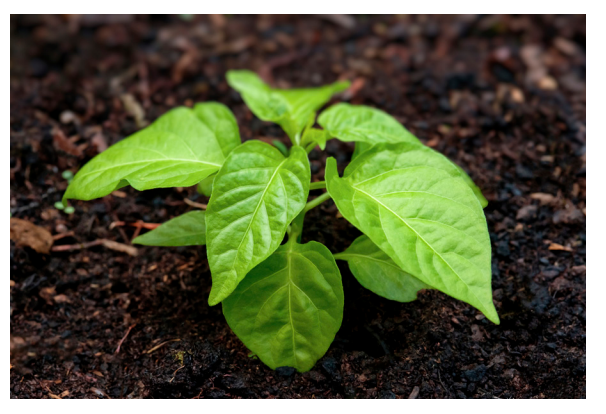
Good organic practices work to build the soil and maintain an ecological balance, rendering chemical fertilizers and synthetic pesticides unnecessary.

The report also details the risks of applying dried biosolids that incorporate nanomaterials, including inflammation of the lungs, fibrosis and other toxicological impacts. Biosolids, otherwise known as sewage sludge, are composed of dried microbes previously