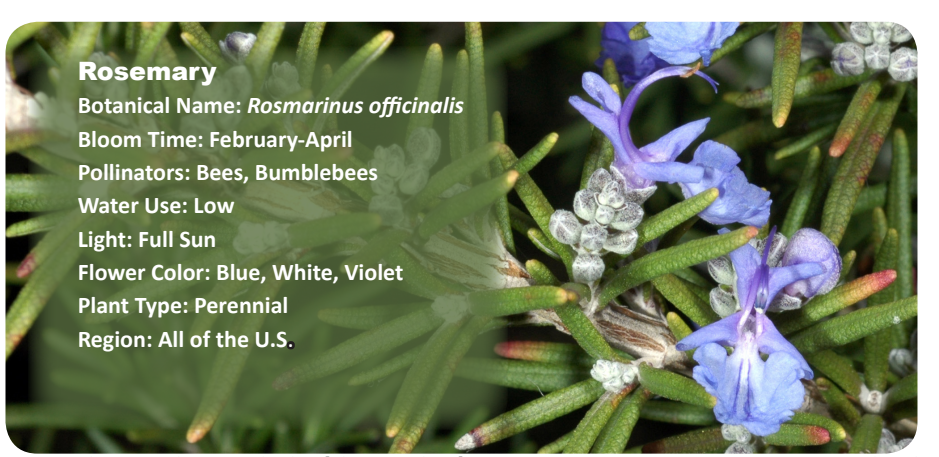
2007 Rosemary, Texas A&M University Horticultural Garden, College Station, TX. 2007. Available at: http://commons.wikimedia.org