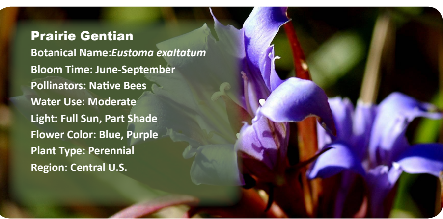
Nebraska Pheasants & Quail Forever. 2012. Penstemon & cudweed. Available at: http://www.nebraskapf.com