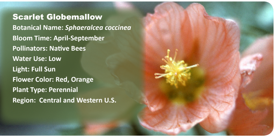
Globemallow, Red False Mallow, Cowboy's Delight, Sphaeralcea coccinea. Available at: http://www.nps.gov