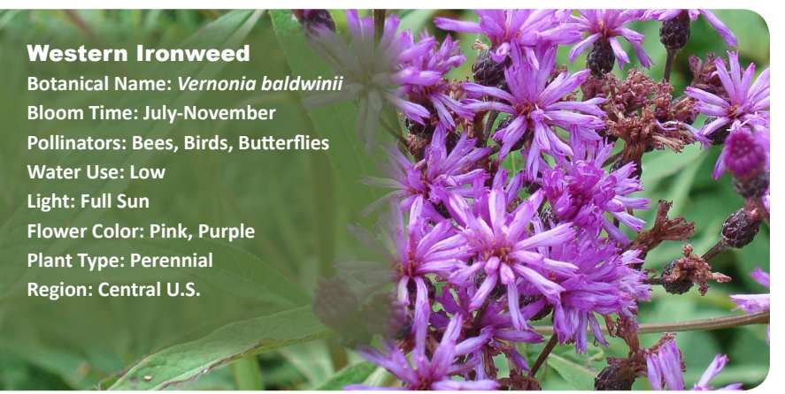
Indiana Department of Natural Resources [Photographer]. 2011. Ironweed at Clifty Falls State Park. Available at: http://bit.ly/13NTKNW