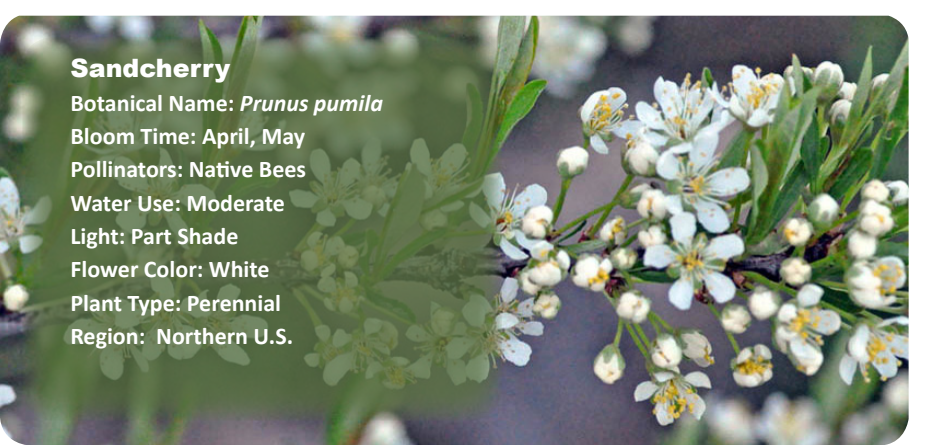
Fiddlehead Creek. 2012. The eastern sandcherry. Available at: http://fiddleheadcreek.com

Fungus Guy [Photographer]. 2011. Wild Prickly Rose. Available at: http://upload.wikimedia.org