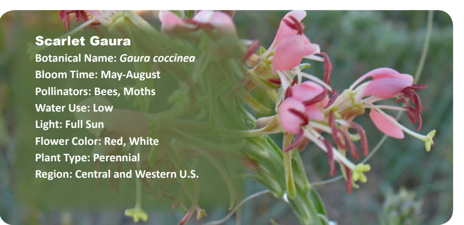
Ghostdial Press [Unknown photographer] 2008.Guara. Available at: http://www.wildflowerchild.info

Walter Siegmund [Photographer] 2008. Ribes sanguineum var. sanguineum. Available at: http://commons.wikimedia.org