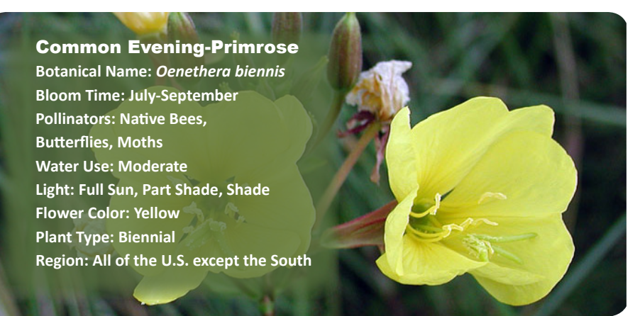
Llewellyn, P. [Photographer]. 2011. Common Evening Primrose. http://www.thewildflowersociety.com

Whittemore, J. [Photographer]. 2011. Candle Anemone. Available at: http://ecologyofappalachia.blogspot.com