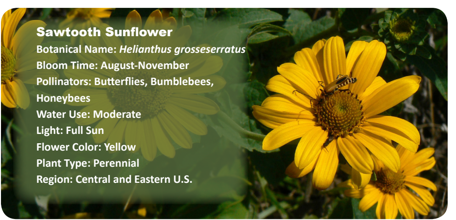
Mongo. [Photographer]. 2011. Sawtooth Sunflower. Available at: http://upload.wikimedia.org

Kojian, R. [Photographer]. 2011. Artemisia ludoviciana. Available at: www.gardenology.org