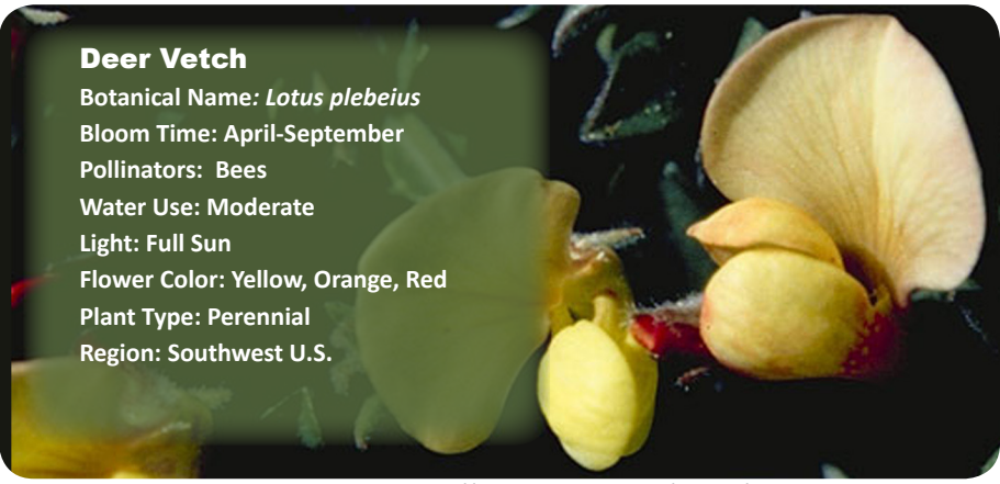
Flaigg, N. 1990. Lotus plebeius. http://www.wildflower.org/gallery/result.php?id_image=8765