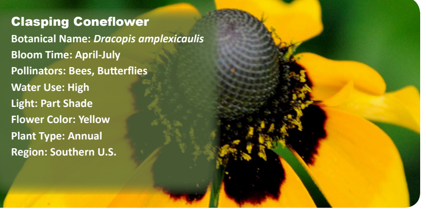
Abbot, L. [Photographer] 2012. Clasping Coneflower. Available at: http://www.lucysinthegarden.com