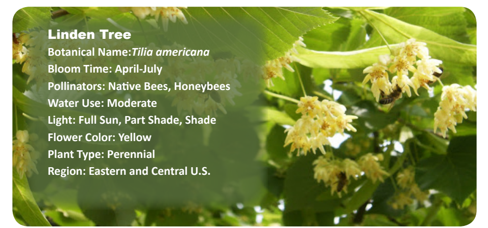
Miggel, C. [Photographer]. 2012. The Linden Realm. http://cathelijnemiggelbrink.blogspot.com/

Hellen [Photographer]. 2011. Lanceleaf Coreopsis. http://middlewoodjournal.blogspot.com