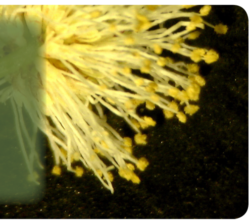
Dehaan [Photographer] 2008. Illinois bundleflower (Desmanthus illinoensis) inflorescence. Available at: https://commons.wikimedia.org

Illinois Bundleflower Botanical Name: Desmanthus illinoensis Bloom Time: May-September Pollinators: Native Bees Water Use: Moderate Light: Full Sun Flower Color: White Plant Type: Perennial Region: Eastern and Central U.S.