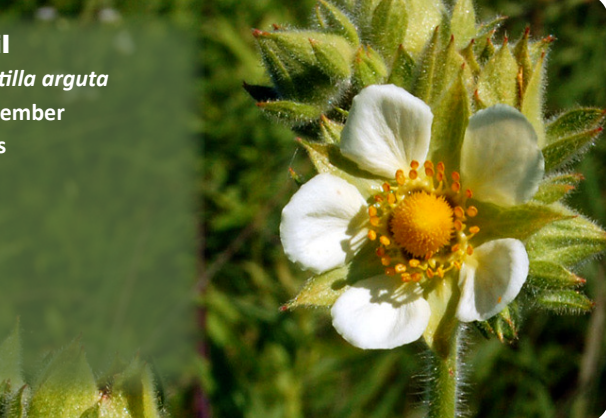
Gorman, P. 2010. Prairie Cinquefoil. Available at: http://swbiodiversity.org/seinet/imagelib/imgdetails.php?imgid=294481

Prairie Cinquefoil Botanical Name: Potentilla arguta Bloom Time: June-September Pollinators: Native Bees Water Use: Moderate Light: Full Sun Flower Color: White Plant Type: Perennial Region: Northern U.S.