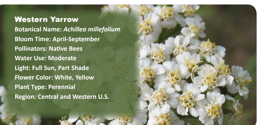
Ghostdial Press [Unknown photographer] 2008.Yarrow97. Available at: http://www.wildflowerchild.info/