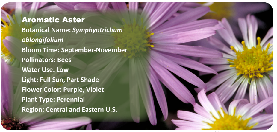
Barnes, T. 2009. Aromatic Aster. Available at: http://upload.wikimedia.org