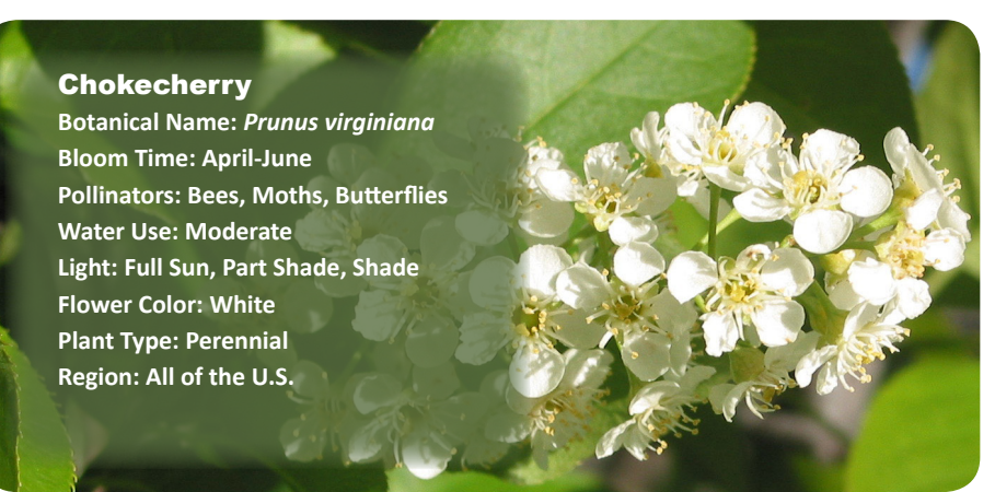
Oregon State University. 2003. Common Chokecherry. Available at: http://www.malag.aes.oregonstate.edu

IPFW. 2010. American Plum. Available at: http://www.ipfw.edu/native-trees/AmericanPlumIconGallery.htm