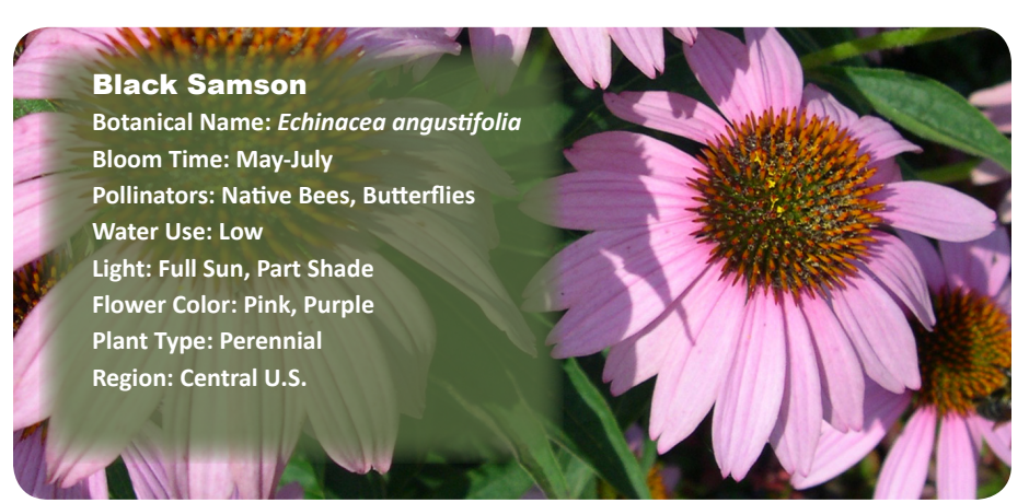
Lorenzos Seeds. Black Samson. http://www.lorenzsokseedsllc.com/perennials-the-backbone-of-your-garden