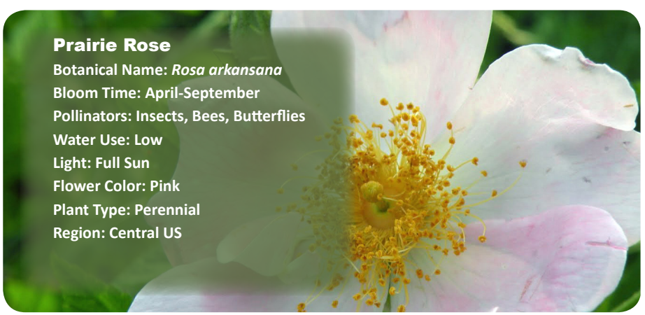
Shepherd, A.J. [Photographer] 2010. Arkansas rose. Available at: http://aubreyshepherd.blogspot.com

Turnbull, L. [Photographer]. Ohio Spiderwort. Available at: https://npsot.org/TrinityForks/TrinityForksWeb/Descriptions/Wildflowers/Ohio%20Spiderwort.html