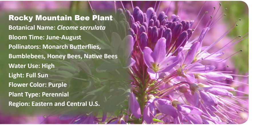
Shock, C. [Photographer]. Rocky Mountain Beeplant. Available at: http://www.malag.aes.oregonstate. edu/wildflowers/images/RockyMountainBeeplantCleomeSerrulata15Aug06MalheurRivPlainOR_07.JPG