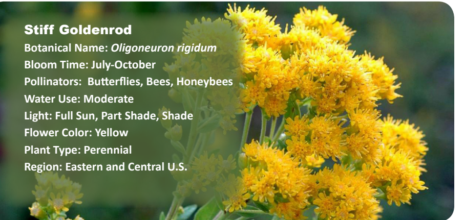
Trigg, R. 2009. Goldenrod. Available at: http://www.heinzetrust.org

Transformational Gardening. 2010. Roundhead Bush Clover (Lespedeza capitata) http://www.transformationalgardening.com/forage/plants/lespedeza-capitata-images.html