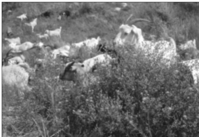
Goats graze a site covered with spotted knapweed.

The goats love Christmas trees, they clean it up, strip all the bark off. The remaining tree trunk could be sold to a youth group, to be cut, packaged and sold as firewood. So the recycling keeps going on and on through all levels of insects, birds, people and different groups of people.