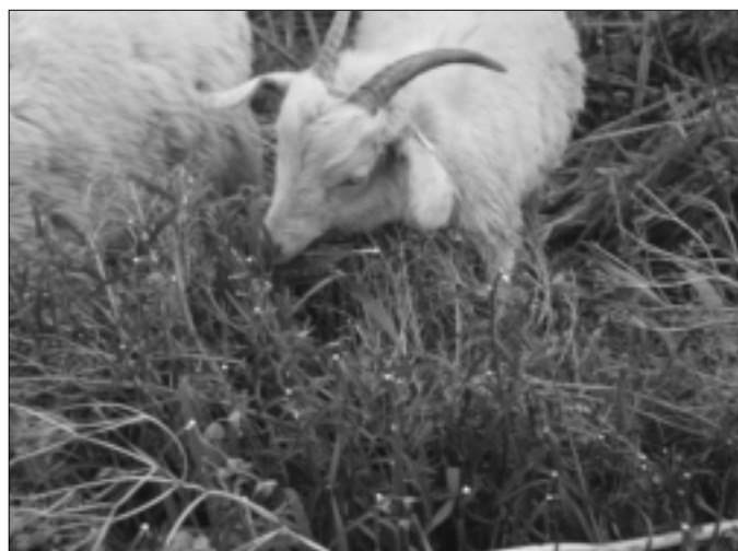
The white latex from leafy spurge oozes from where the goats have snapped off the tops of the plant. An enzyme in the goats saliva detoxifies the latex before they swallow it.

Timing of when to graze a weed is important to making the biggest impact. If wildflowers are your goal for the land, yet you have to control your noxious weeds by law, I would graze to stress the weed when the wildflowers were not yet in bloom. For