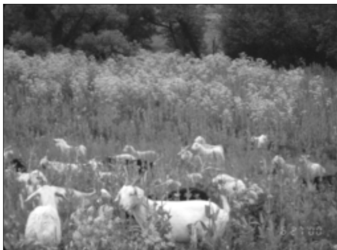
Teasel and poison hemlock grow so high, left, that the goats in the background are hidden. The goats eat the teasel and poison hemlock's flowers and leaves, allowing sunlight to reach the ground, right.