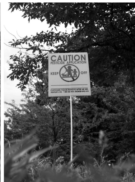
Occupational pesticide exposure, rural living, farming, well water consumption and residential pesticide use have all been linked to elevated rates of Parkinson's disease.