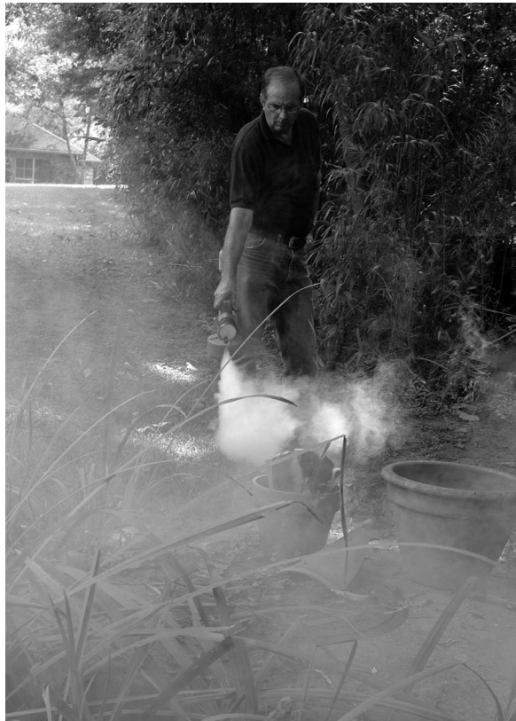
There is some data that shows a significant association between men, exposure to pesticides, and Parkinson’s disease.

However, there are epidemiologic and toxicologic studies that have identified specific pesticides linked to PD. (See page 18.) Studies that identify the mechanisms by which pesticides lead to PD, such as protein aggregation (a-synuclein), effects on the striatal dopaminergic