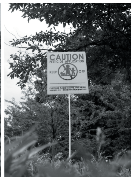
Occupational pesticide exposure, rural living, farming, well water consumption and residential pesticide use have all been linked to elevated rates of Parkinson's disease.