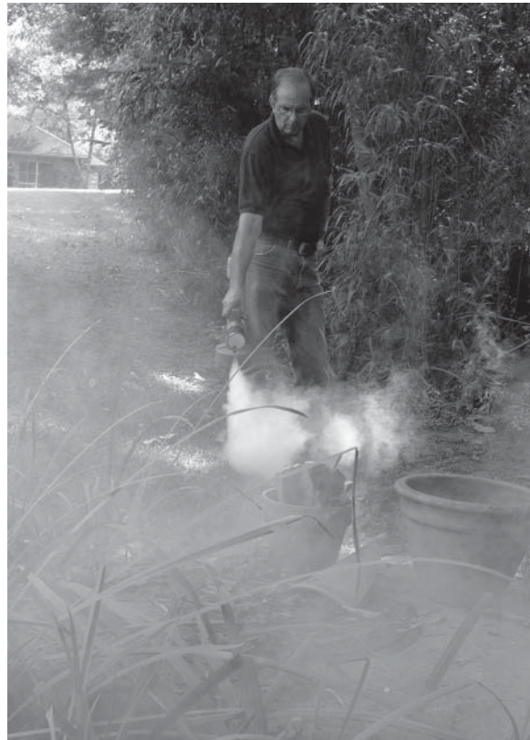
There is some data that shows a significant association between men, exposure to pesticides, and Parkinson’s disease.

However, there are epidemiologic and toxicologic studies that have identified specific pesticides linked to PD. (See page 18.) Studies that identify the mechanisms by which pesticides lead to PD, such as protein aggregation (a-synuclein), effects on the striatal dopaminergic